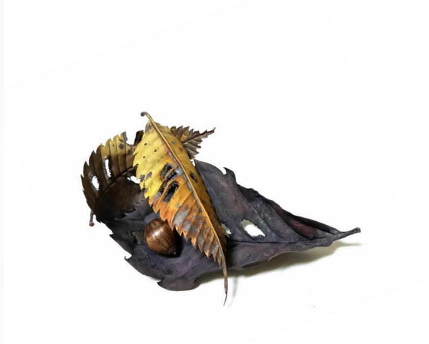
Tiny Piece of Autumn, 2017