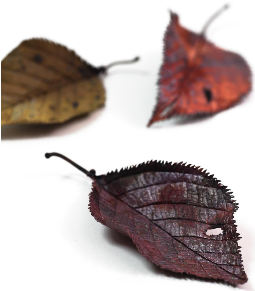
Cherry Red Leaf, 2017