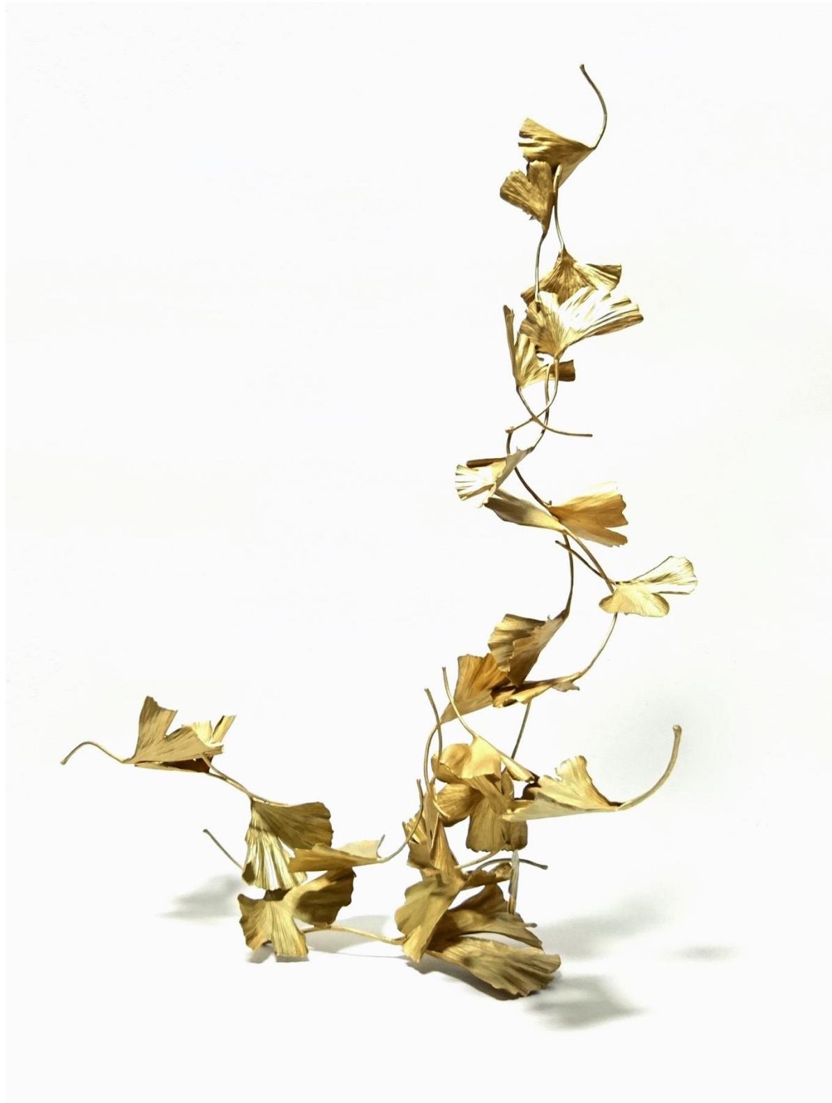
Ginkgo, 2017 H17 1/4 W9 1/4 D6 3/4 in (H43.5 W23 D17 cm)

*Opening Reception with artist : December 7, 6 – 8 p.m.