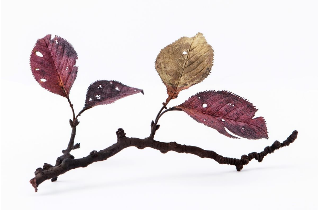
Cherry Red Leaf, 2017