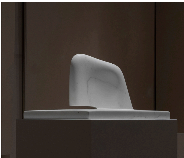
Kan Yasuda, KAISEI "Rebirth", 2006, White marble, H10 5/8 x W22 x D13 3/4 in (H27 x W56 x D35 cm), 88 lbs (B29736)

Ippodo Gallery is a cultural bridge to Japan's living master artists. Founded in Tokyo (1996-), the New York gallery (2008-) presents fine handcrafted and rare works created using traditional materials and methods. Each piece selected embodies Japanese aesthetic sensitivity that is born of a spiritual bond with nature. Ippodo's exhibition program features unique objects — fine ceramics, lacquerware, metal crafts, sculpture, paintings, and works on paper — that celebrate human invention, the natural world, and sublime beauty.