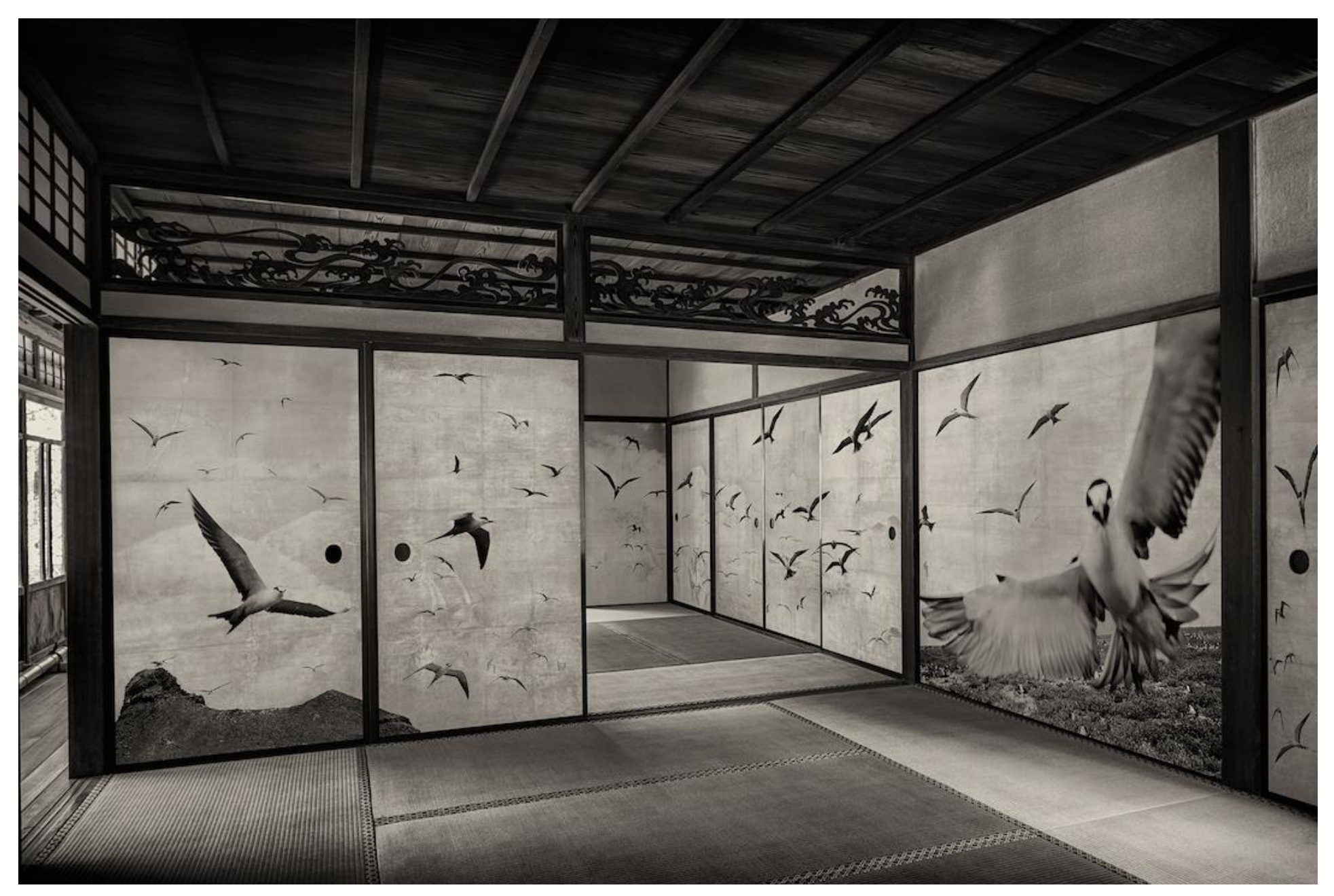
Flock 2016 Composite film and digital capture

Ippodo New York: March 10 – April 22, 2016 *Opening Reception: March 10, 6 – 9p.m. Ippodo Tokyo: March 31 – April 9, 2016